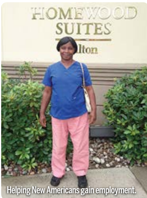
Helping New Americans gain employment.